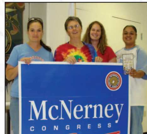
595 delegates to Women's Conference return and pledge to volunteer.