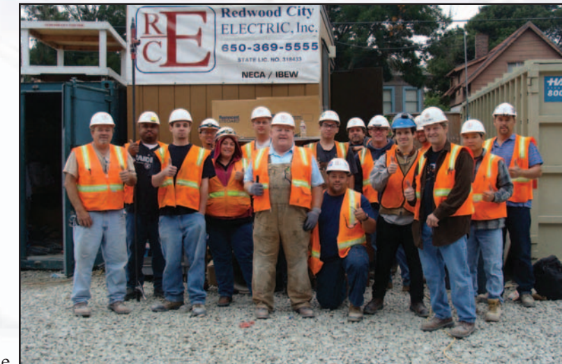
595 members at Kaiser's Medical Office Building project in Oakland. Hospital work is expected to employ many union construction workers in the coming years.

Working people have had a tough eight years under the Bush Administration. The record budget surpluses that were generated under the Clinton Administration have been squandered; good paying jobs have been off-shored and out-sourced; working families are now earning less in real dollars; record numbers of families have no health insurance; the income gap between the wealthy elite and