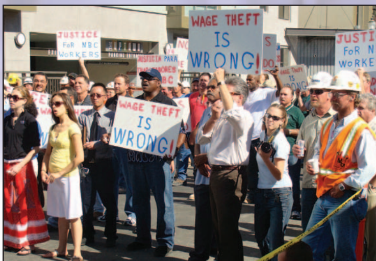
Over 100 union members and friends rally to support NBC workers.