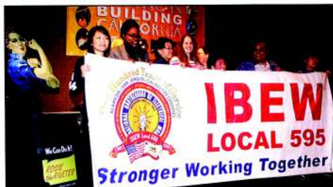
595 members proudly displayed our banner at the conference.

Local 595 helped sponsor the event's reception, held this year on the 21st floor of the Oakland Marriott—great food, jazz