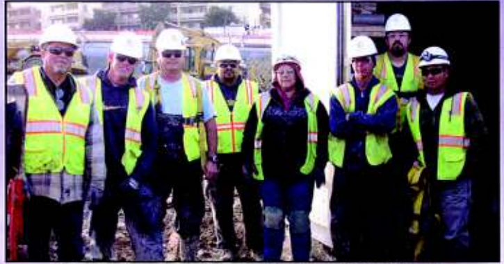
595 Members working for Redwood City Electric at the new Kaiser Hospital in Oakland.

Mark your calendars: Due to the July 4th Holiday Weekend, Re-Sign Day will be on Tuesday, July 6, from 7 AM to Noon.