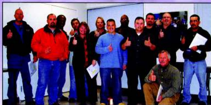
New 595 members were sworn in at the March 11 general membership meeting. Welcome to 595!

We are looking at creative ways to use technology to organize. Social networking sites like twitter and facebook are being used by locals across the United States to run campaigns and make contact with unrepresented workers in our trade. IBEW 595 Organizers attended the 9th district organizing conference last month, workshops included- "Basic labor law training", "using technology to organize", "top down organizing", "top down role playing exercises", and "strategic salting". These trainings have proven to be very valuable and useful in our organizing efforts. If you have any suggestions on