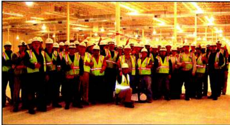
Local 595 members working for Sprig Electric at one of the Solyndra sites in Fremont. Another site is also underway with Rosendin Electric.

Good news: Our 595 West apprentices are all working and we have even been able to help our sister Local 6 by putting some of their apprentices to work. When our program was hit with high unemployment five years ago, Local 6 and surrounding locals helped put our apprentices to work, and we are now