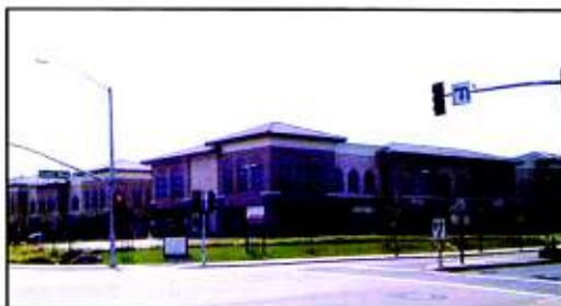
Across from 595's Hall, a large commercial complex was built without any union workers.

Looking at the work that we used to do, and the work that we no longer do, tells us that we need put some new tools in our IBEW organizing belt. Our current course, where we see our participation in some markets declin-