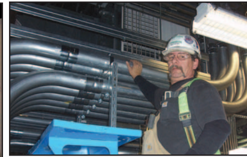
Around the Bay...595 members at Apple Data, Emery Station, Jack London Square and Oxford Plaza.