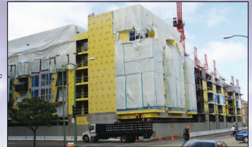
Blight in Oakland - The City Walk project, where non-union Helix Electric was working, has been sitting idle since July 2007. It is now being wrapped by its developer, the Olson Company, its future uncertain.