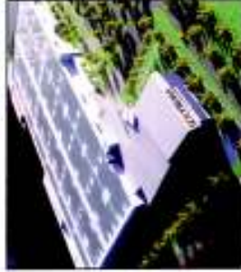
The final phase of construction will be 600,000 square feet of PV manufacturing

Solyndra's deal is the vanguard of $30 billion in loans guarantees federal officials will offer clean-tech