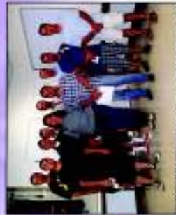
New 595 members after being sworn in at the August 13 membership meeting.

ARTICLE XXI, Sections 4 & 5 of the IBEW Constitution states: "Any member indebted to his L.U. for six (6) months' full dues shall be dropped from membership