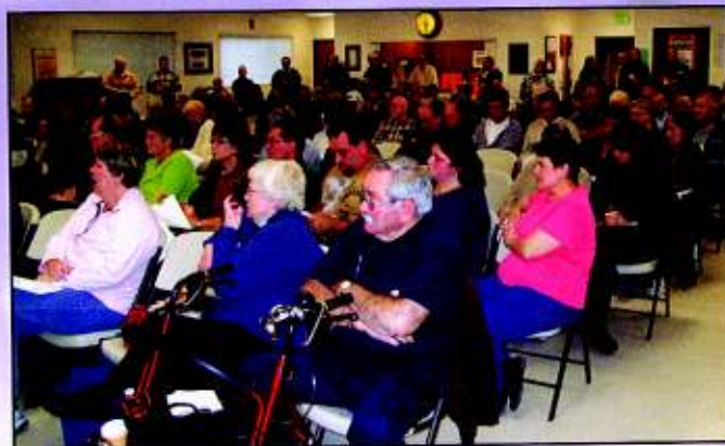
595 members and families attended the Jan. 9 Benefits Fair

We are happy to report that Congress voted on December 19th to allow eligible workers to receive subsidized Cobra premiums for up to 15 months. It had previously been 9 months and was running out for many members. The decision also extended the cutoff date for