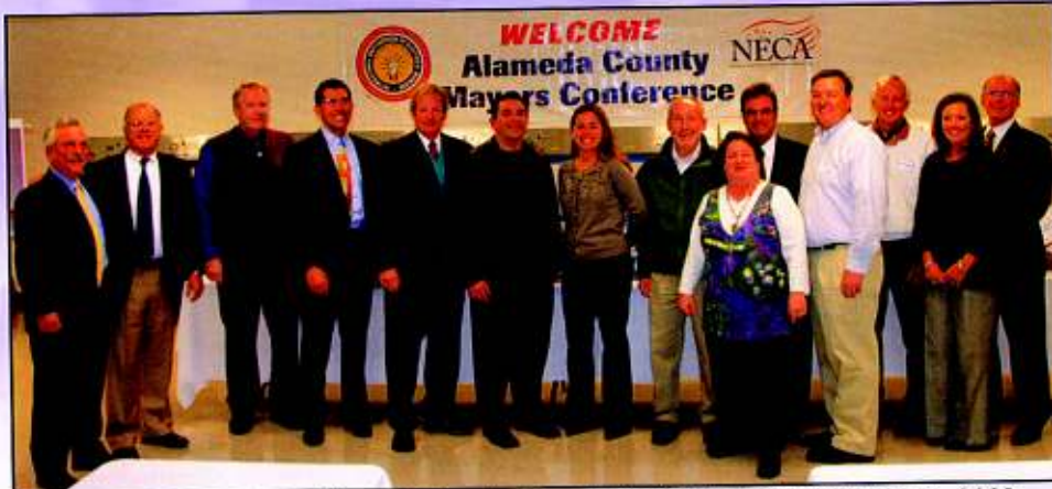
The JATC hosted the Alameda County Mayors Conference on December 9, 2009.