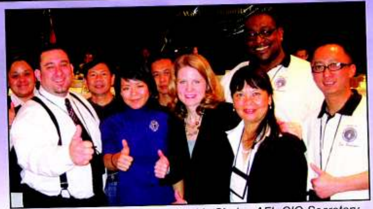
Local 6 and 595 members give Liz Shuler, AFL-CIO Secretary Treasurer, a big welcome at the EWMC conference Jan. 15. Liz is an IBEW member who worked with 595 on political campaigns.