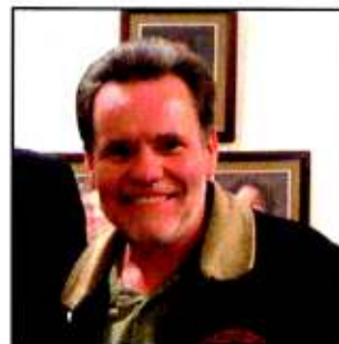
Tom says, "Get tested!"

the immediate results and was mailed a complete evaluation of my blood work and testing a couple of weeks later.